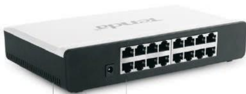
Side Vent Bottom Vent 94V0 Fireproof Plastic Housing